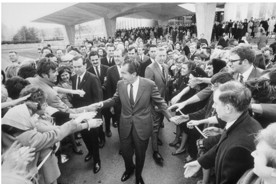
In a pleasant moment, President Nixon is shown here on his only visit to CIA Headquarters in March 1969. He would, however, have a strained relationship with intelligence. His national security team pressed Intelligence Community leaders to find ways to better evaluate and improve the quality of IC analysis.