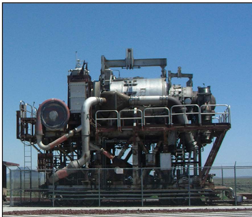
One of two experimental reactors for development of aircraft nuclear propulsion on display at the Idaho National Laboratory as of July 2009.

Other considerations remained, including the interests of those who were incurring the expensive development costs and stood to gain from hoped for procurement of the systems. Not least among these considerations was the very fact of competition with the Soviet Union. Knowledge (or at least belief and fear) that the Soviet adversary was working to develop the same capabilities fueled the competition. So both intelligence—and even incomplete intelligence—on the adversary's