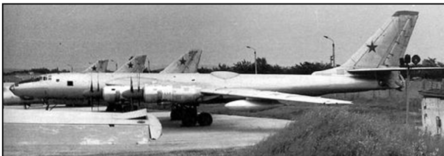
An image purporting to be of the Swallow , a modified Tu-95 designated the Flying Atomic Laboratory. Date and provenance of photo unknown.

From 1952 to 1955 in the USSR there had been discussions and studies, even including the construction of full-scale mockup of