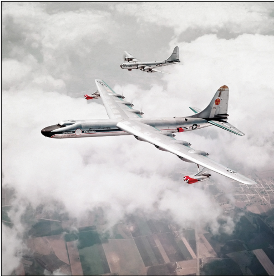
The NB-36H in a test flight over Texas accompanied by a B-50. It was meant to test shielding of a reactor that was to power an aircraft nuclear propulsion engine.

This interpretation stimulated Soviet scientists working on aircraft nuclear propulsion (ANP). 4