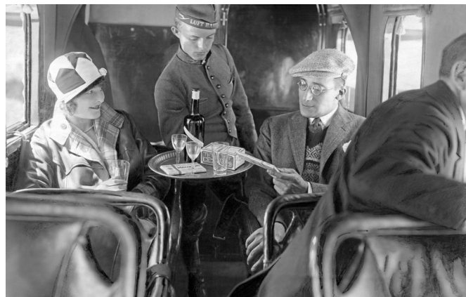
Heinkel He. 111, in passenger mode, ca. 1940 on the left. In this configuration, the interior was designed in such a way that it could readily be converted from a comfortable passenger compartment, as in the image on the right from another aircraft, into a bomb bay.