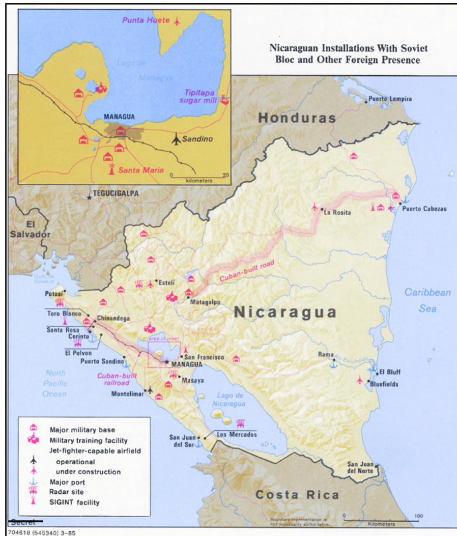
The inset map above shows the relative locations of Managua and Punta Huete—about 25 kms across Lake Managua. It appeared in SNIE 83.3-3-85, Nicaragua: Soviet Bloc and Radical Support for the Sandinista Regime , March 1985.

As a result of administration concerns about the escalating threat to US strategic interests in Central America, Reagan addressed a joint session of Congress on the situation in April 1983. After stating that the region was of vital importance to the United States because of its location adjacent to the Caribbean Basin and the Panama Canal, he noted the continued Soviet military presence in Cuba, including a combat brigade and visits by Soviet submarines and military aircraft. He then warned that the Sandinista regime in Nicaragua, assisted by Cuba and the Soviets, had become a destabilizing presence in the region as a result of its support for the Salvadoran guerrillas and other leftist insurgent groups and because of its continued military