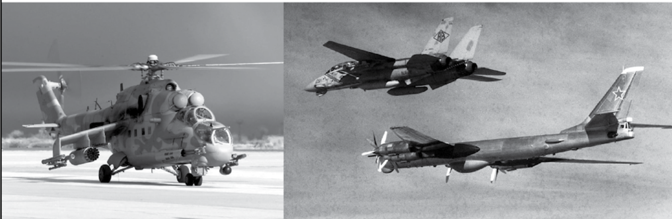
(Above left) What was initially suspected in November 1984 of being a shipment of MiG-21s to Nicaragua turned out to be a delivery of lethal attack helicopters, Mi-24 (Hind), also known as Flying Tanks. (Above right) A US Navy F-14 fighter escorts a Soviet Tu-95 (Bear) reconnaissance flight as the Bear overflies US naval activity in the Atlantic.

America and the Caribbean.” It went on to address its concerns about Cuba, Grenada, Nicaragua, El Salvador, and Fidel Castro personally.