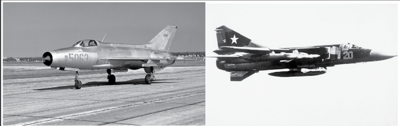
The MiG-21 (Fishbed) (above left) was repeatedly promised to the Nicaraguan Air Force. It never materialized. The Soviet Union had supplied fighter/interceptor aircraft—MiG-23 Floggers (above right)—to Cuba, and there existed concern that some would be shipped to Nicaragua.