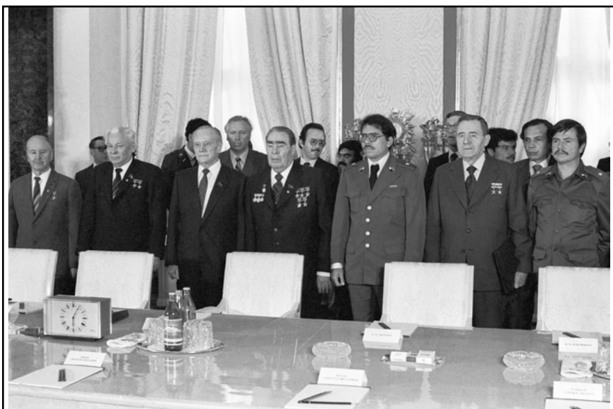
Daniel Ortega during a highly publicized visit in May 1982 to Moscow and a meeting with Soviet leader Leonid Brezhnev, who promised a visit to Nicaragua. None of the public statements alluded to any aid beyond diplomatic support to the Sandinista leadership.

NSDD 17 tasked senior government officials to develop military contingency plans against Cuba and Nicaragua and a public affairs strategy to inform the public and Congress of the situation in the region. NSDD 21 explicitly stated that the United States “will not tolerate the introduction of fighter aircraft into Nicaragua.” 8 Later in the year, Reagan and his security team agreed that if Nicaragua acquired MiGs, the US military would attack and destroy them. In addition, both the Nicaraguan and Soviet governments were warned that the United States strongly opposed