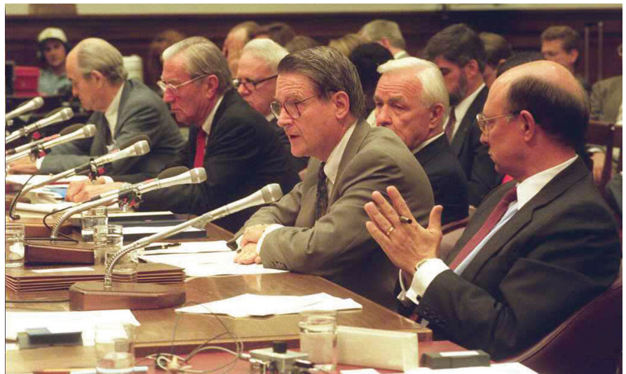
Six former DCI’s in May 1995 appeared before the House Select Intelligence Committee, whose report in 1996 proposed separation of the DCI from CIA’s management, among other major recommendations.

Aspin-Brown declined to quarrel over the key DoD powers. Its report promised not “to alter the fundamen-