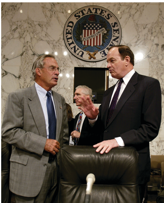
Porter Goss and Richard Shelby, chairs, respectively, of the House and Senate intelligence committees, confer before opening on 18 September 2002 of the Congressional Joint Inquiry into the events of 9/11.

(alerting to possible flight school activity by potential hijackers, though I think this episode is exaggerated a bit by hindsight). The JI was not able to pursue some of the leads it uncovered, some fruitful some not, to firmly evidenced conclusions. The 9/11 Commission was later able to stand on the shoulders of the JI's original work and excellent work done by a CIA analytic team as well as the very thorough FBI "PENTTBOM" investigation—the shorthand name of FBI's investigation of 9/11.