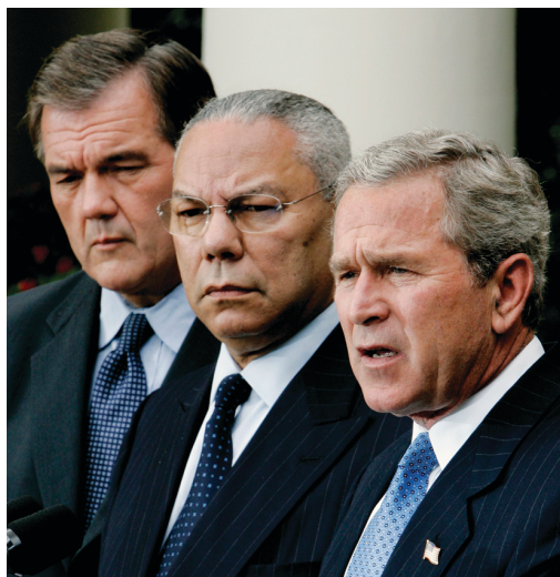
On 2 August 2004, President Bush told a Rose Garden press conference that his administration endorsed establishment of a DNI.

The experience of Britain's Security Service (MI-5) also influenced the NCTC model. MI-5 is actually a relatively small agency that—bridging foreign and domestic work in counterterrorism—gains much of its strength from pooling expertise and orchestrating relevant activities of other executive agencies, like police forces and the Secret Intelligence Service (MI-6).