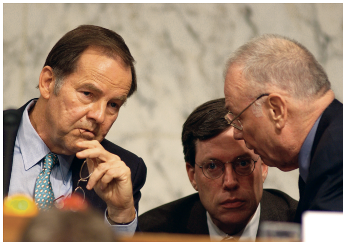
9/11 Commission Chairman Kean (l), Vice Chairman Hamilton (r), and author discussing testimony on 13 April 2004.

This was true for the creation of several of the major institutions created in the 1940s and 1950s, like the Joint Chiefs of Staff and the Office of Special Services. It was true again.