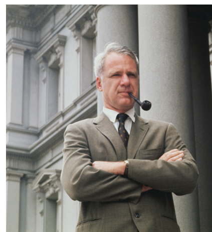
James Schlesinger, as deputy director of Office of Management, floated the idea of creating a director of national intelligence in 1971.

As in 1961, two recurrent concerns animated this reform proposal. One was substantive: a Pentagon-centered approach tended to be more parochial, less objective