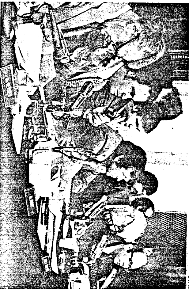
Senate Watergate Committee has yet to look into the Wallace shooting and the death of Mrs. Hunt.

The reason McGovern was so easy to beat was for instance the fact that he is the only Presidential candidate in the