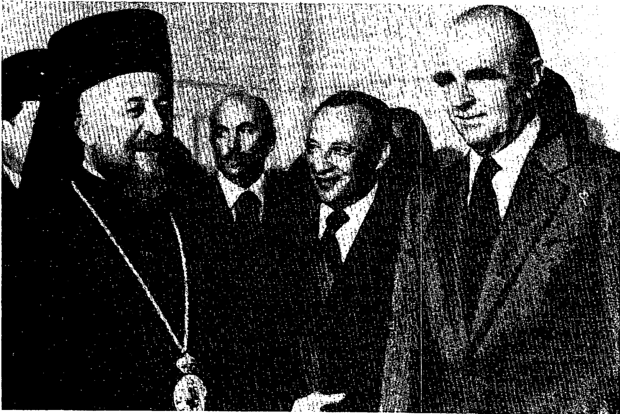
Makarios with Clerides (c) and Karamanlis