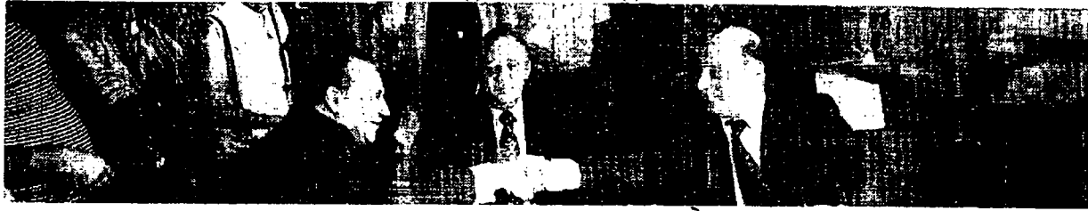
Clerides (l) and Denktash (r)