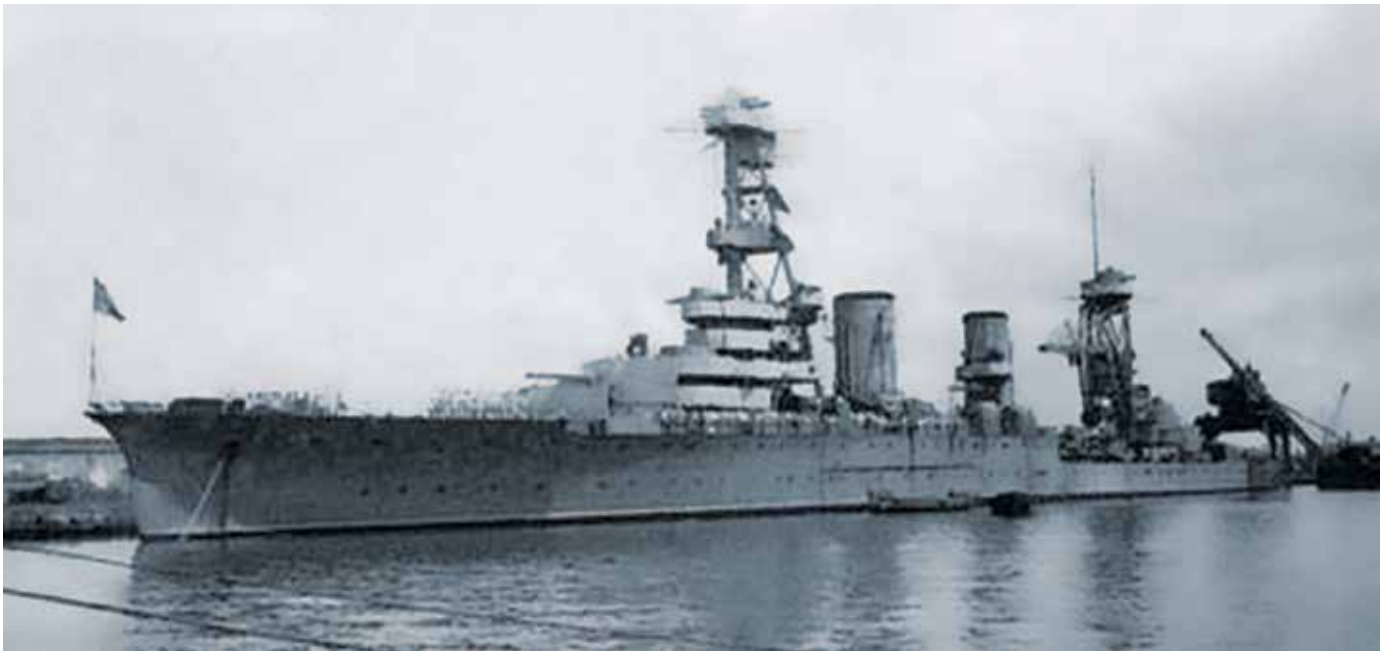
Soviet battleships—fighting U-boats in the Baltic Sea, WWII

The CIA intelligence reports, produced by the Directorate of Operations (DO) 3 made a significant contribution to understanding the history, plans and intentions of the Soviet Navy. Many of these documents are being released for the first time. These intelligence reports, however, do not represent the complete record—much information essential in the estimative process was from émigrés and defectors, as well as from the U.S. Navy, and imagery and signals intelligence, which are not specifically highlighted in this collection.