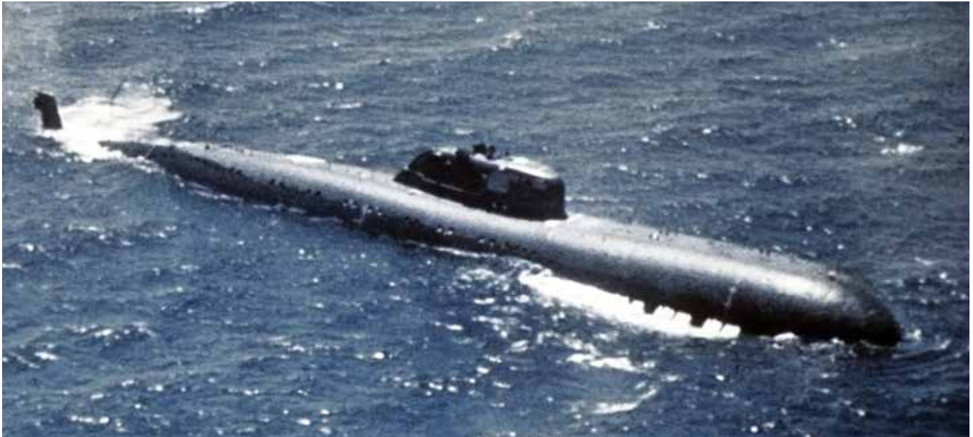
An aerial starboard beam view of a Soviet Charlie I class nuclear-powered submarine underway

War only reinforced Stalin's conviction that the USSR needed a large ocean-going navy. The Soviet leader pushed forward a large construction program that began producing cruisers and fast destroyers at about the time of his death in 1953. 3