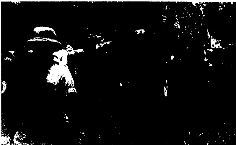
American and Burmese recruits training for behind-the-lines service with Detachment 101.