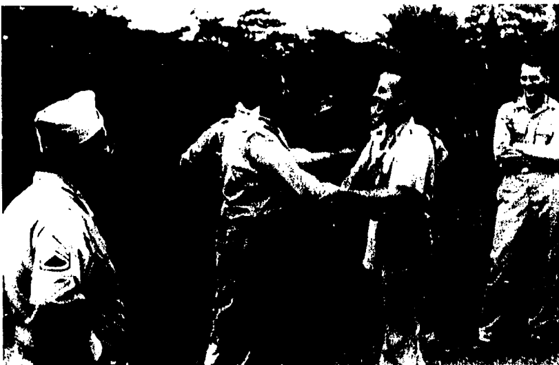
Celebrating Lifer's promotion to colonel in the field.

As we prepared for the day's march, my head felt a bit sore from some hard object in my musette bag. Repacking the bag, I checked to see what it was, and found that the object which had annoyed me during the night was nothing less than some blasting caps. As we started out Dave said, "Damn, that was a wonderful sleep." During the day we arrived at a village that was having a sacrifice to the spirits. As we approached the outskirts of the village, bamboo poles with cups tied to the top of them filled with fresh blood greeted us. Blood was splashed along the trail. As we neared a hut in the center of the village we heard singing and wailing. I was unable to determine what the sacrifice was being held for, but I believe someone had died. In the center of the village was a fresh goat's head, which indicated that the person for whom the sacrifice was being held was not of too great importance.