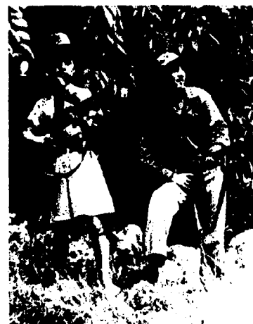
Two Kachin guerrillas supporting Detachment 101 in Burma.

The trek between Ngumla and Kajitu was more or less uninteresting; however, I felt sorry for the horse and walked a greater part of the way. About half way, Majors,