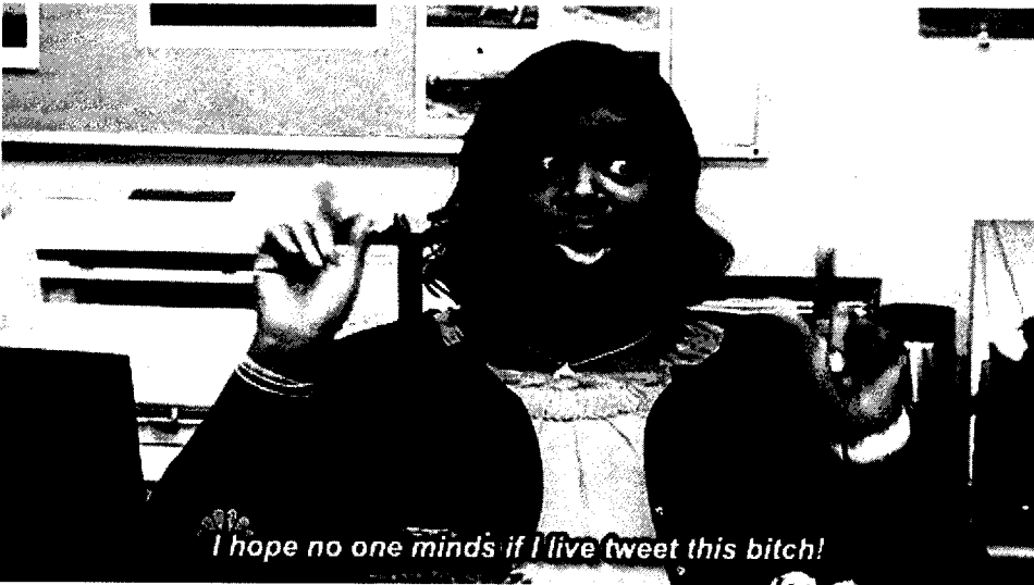
*it's funnier if you aren't ICED

How about all comments and edits back to me by OOB 2/25?