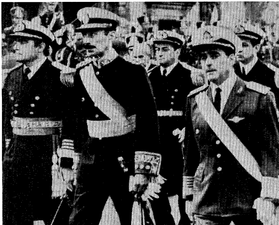
Junta members (L to R) Admiral Massera, President Videla, General Agosti

In the past week or so, Massera has directed thinly veiled public criticism at the President and his chief ally, army chief of staff General Roberto Viola.