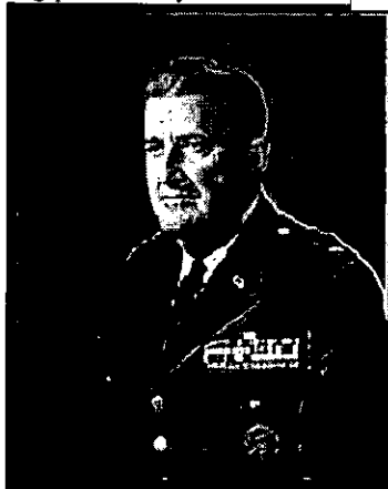
Vernon Walters (1917 - 2002)