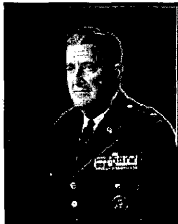
Vernon Walters (1917-2002)