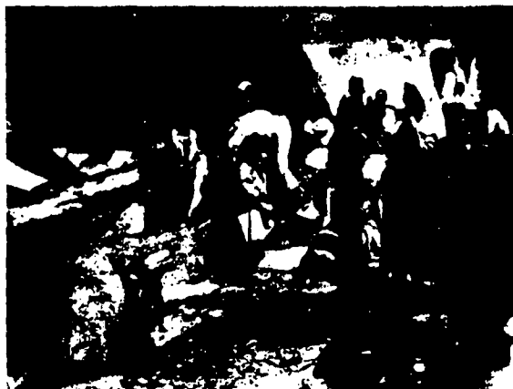
ARAB REFUGEES from Palestine still live in tent settlements only 25 miles from their homeland. Their plight makes grist for the mufti's propaganda.

What Haj Amin had said was one man's point of view. There were other powerful viewpoints to contradict his argument. But it was one shared by thousands of important and millions of unimportant people in an extremely sensitive part of the world.