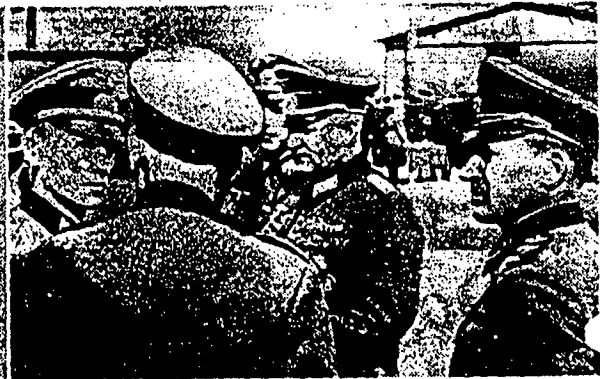
Gehlen, on left, on wartime visit to interrogation camp for Russian prisoners-of-war.