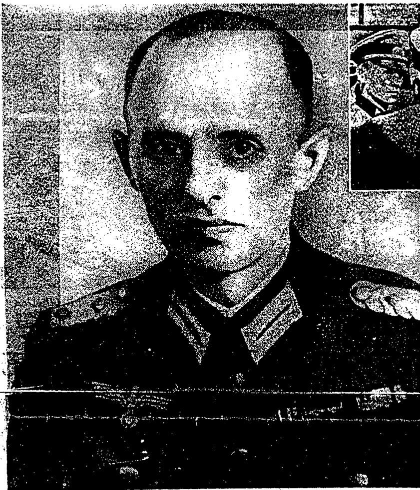
Wartime picture of Gehlen. His appearance today is little changed except that he has a moustache.