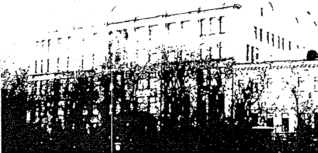
Central Committee building

Consequently, the struggle for power in the Politburo has in the past become a battle for influence within and among the institutions that implement Politburo policies. Stalin used his position in the party Secretariat to achieve political preeminence, but in the 1930s he relied on the security organs to establish a personal dictatorship over the Politburo and all other Soviet institutions. Stalin's rule so weakened the party's bureaucratic machinery that the institutional pecking order was not self-evident in the early post-Stalin years. Leaders in three different institutions—the party (Khrushchev), the government (Malenkov), and the police (Beriya)—sought to gain primacy, with Khrushchev and the party winning out after four years. Brezhnev, too, used the party as his institutional base, although he had to share power and the spotlight with Premier Kosygin for a time.