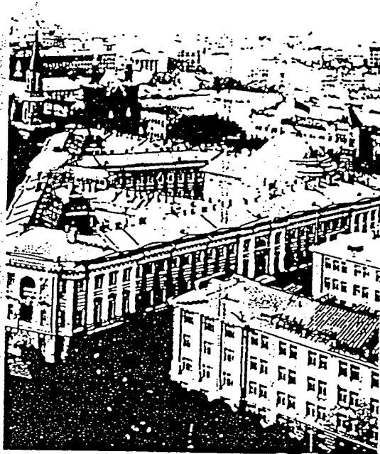
Presidium of the USSR Council of Ministers.

secretary. These departments monitor the activity of government ministries, the military, the security organs, and other institutions. One of them, the General Department, provides staff support for Politburo activity.