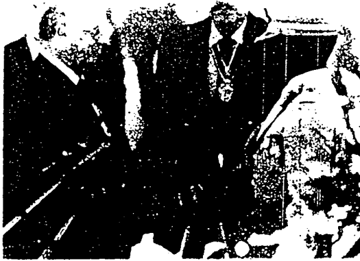
Figure 4. Prime Minister Botha and President Machel after signing the Nkomati Accord between South Africa and Mozambique, 16 March 1984.

UNITA, dos Santos would still depend on the USSR for military support. Moscow would hardly be sanguine about the MPLA's success, however—given its inability to defeat UNITA even with 30,000 Cubans on its side.