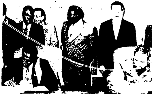
Figure 3. Angolan President dos Santos and Cuban President Castro signing a joint communique, 21 March 1984

1 UN 435 calls for a cease-fire, a phased withdrawal of South African forces from Namibia, and the establishment of a UN force to oversee preparations for Namibian elections.