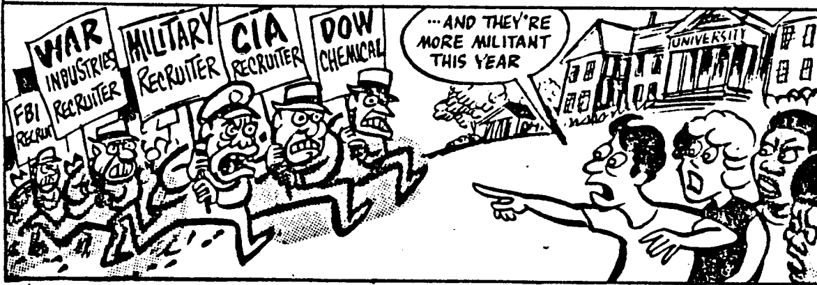
Daily World (Communist) 6 SEP 1969

J. EDGAR HOOVER PREDICTED U.S. CAMPUSES WILL HAVE A "CONTINUATION OF THE SENSELESS FLUNDER" BY "FIREBRANDS"