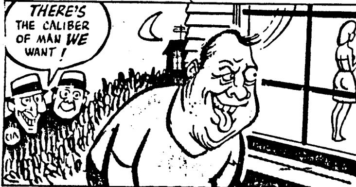
Daily World (Communist) 8-16-69

CIA RECRUITER SAID "WE ARE NOT INTERESTED IN THE MAN WHO WANTS TO MAKE MONEY - WHAT REALLY COUNTS IS MOTIVATION."