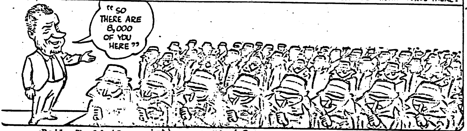
Daily World (Communist), 4-26-69

NIXON, DURING VISIT TO SUPER-SECRET CIA HEADQUARTERS NEAR LANGLEY, VA., ACCIDENTLY REVEALED THE "WORK" FORCE THERE: