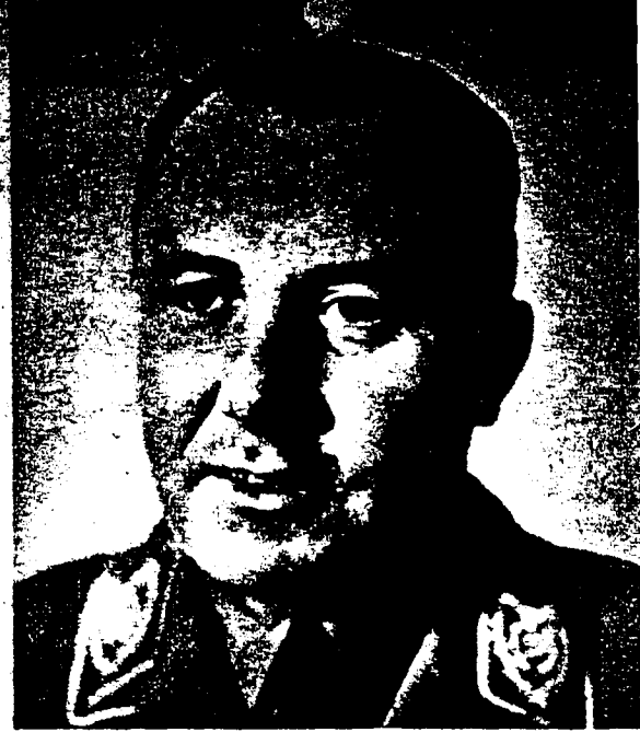
Missing since 1945, Martin Bormann, Hitler's political heir has been reported dead, but he is probably hiding in Brazil.

knew his true identity. Some in the Mercedes plant referred to him openly, respectfully as "Herr Obersturmbannführer"—his old Nazi title. Once he lost his temper with a colleague, dropped his mild manner and snarled: "You dirty Jew!"