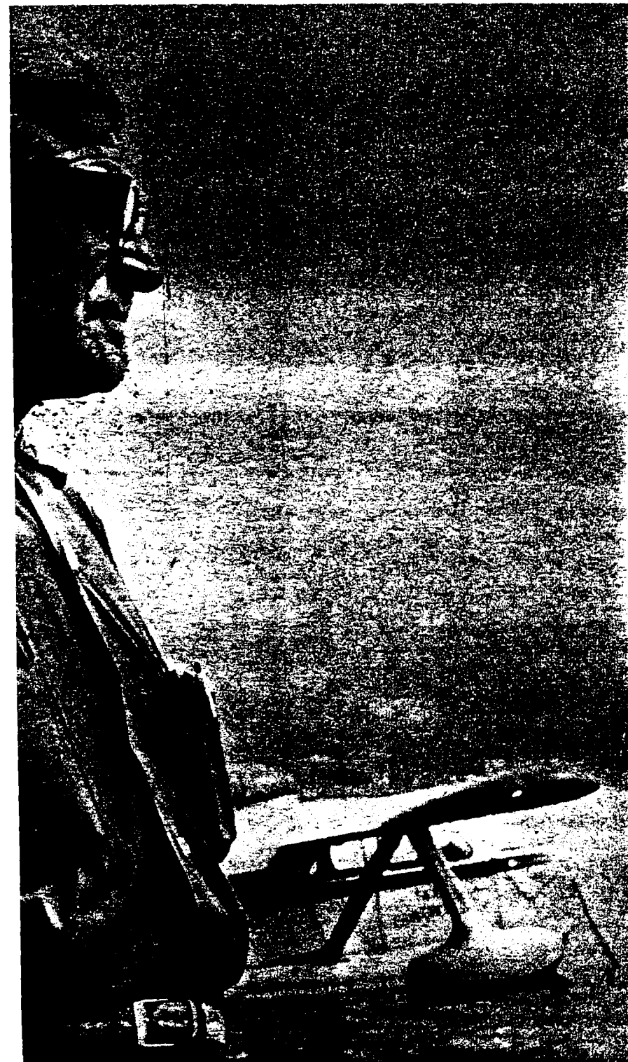
Notorious war criminal, runs a thriving seaplane business for tourists in Brazil.

But in the company of his Nazi cohorts, he was a much different man given to hard drinking and boastful talk. Then his eyes would glitter. Of course, they