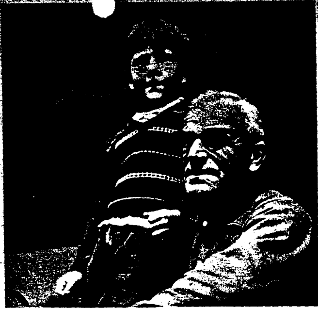
Mystery boy, who turned up in Cukurs home recently, nestles against ex-Nazi. The child may be a plea for sympathy.