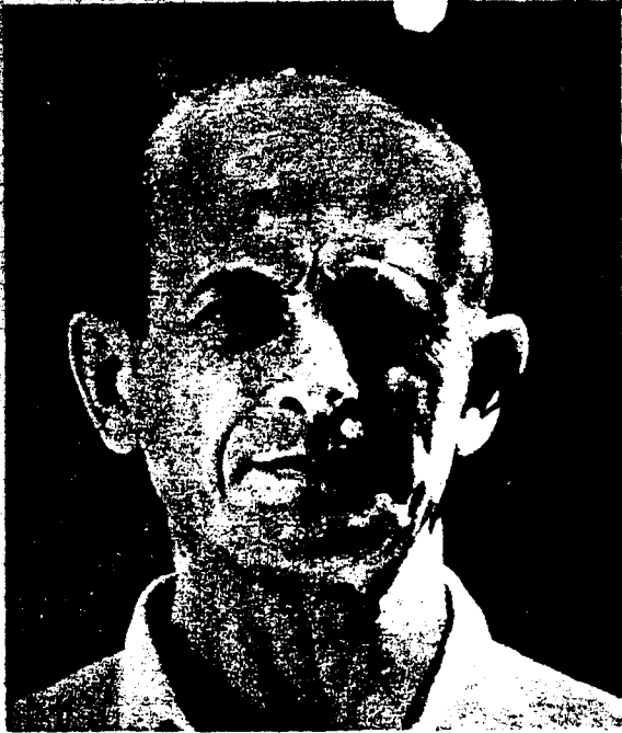
Awaiting trial, ex-SS Colonel Adolf Eichmann was captured by Israelis in Argentina after 15-year world-wide manhunt.