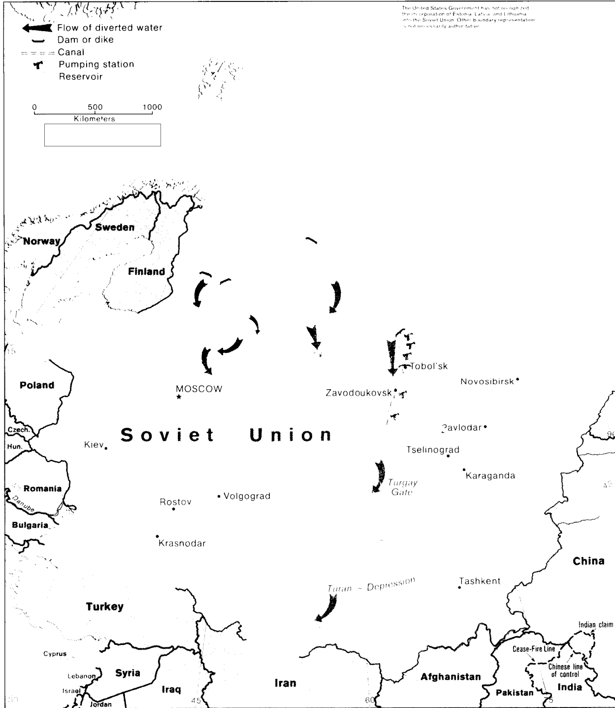
Figure 2 Proposed Diversion of Northward-Flowing Rivers