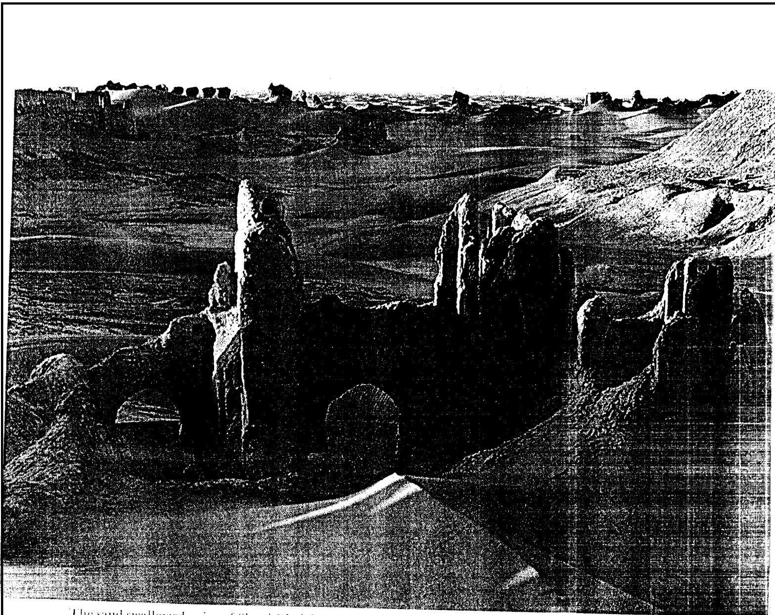
The sand-swallowed ruins of Shari-Gholghola in the Nimruz desert.