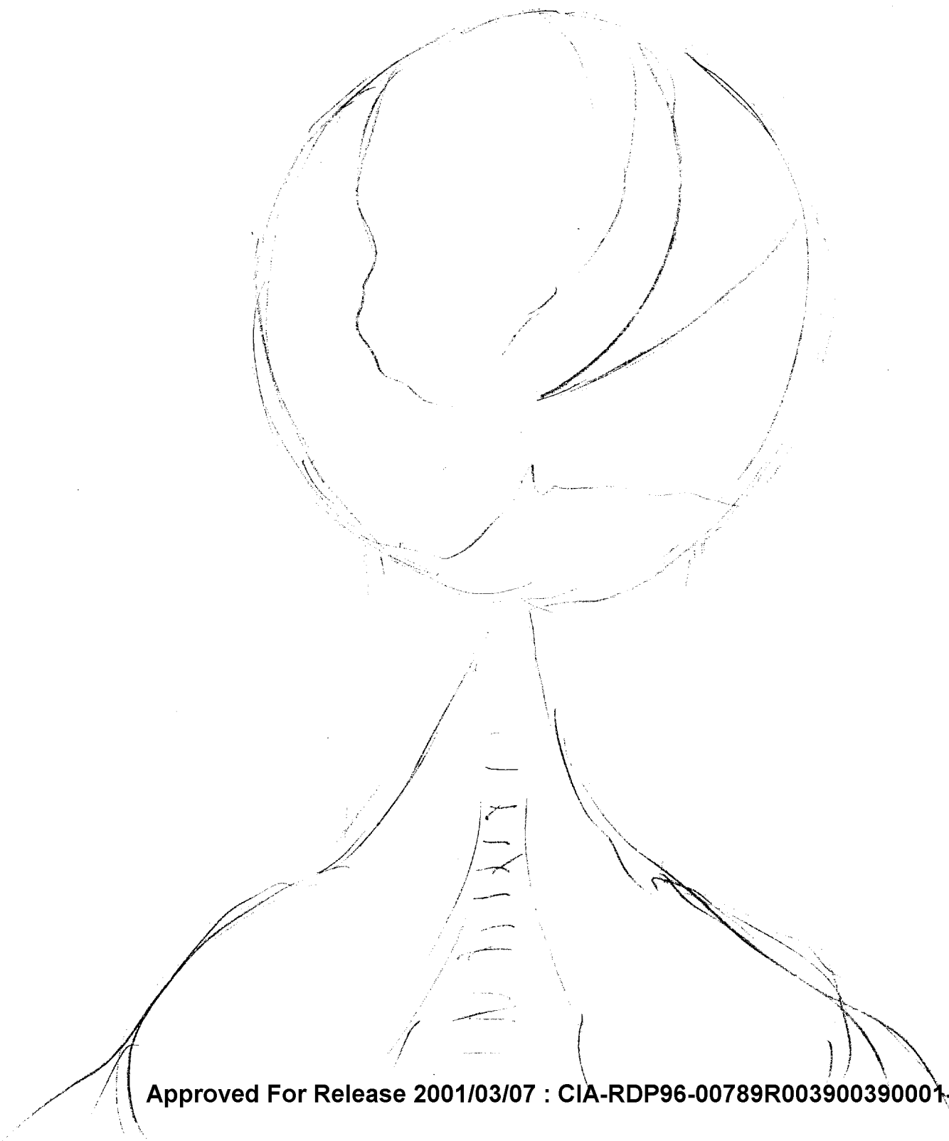
Photo in an open area New York World's Fair