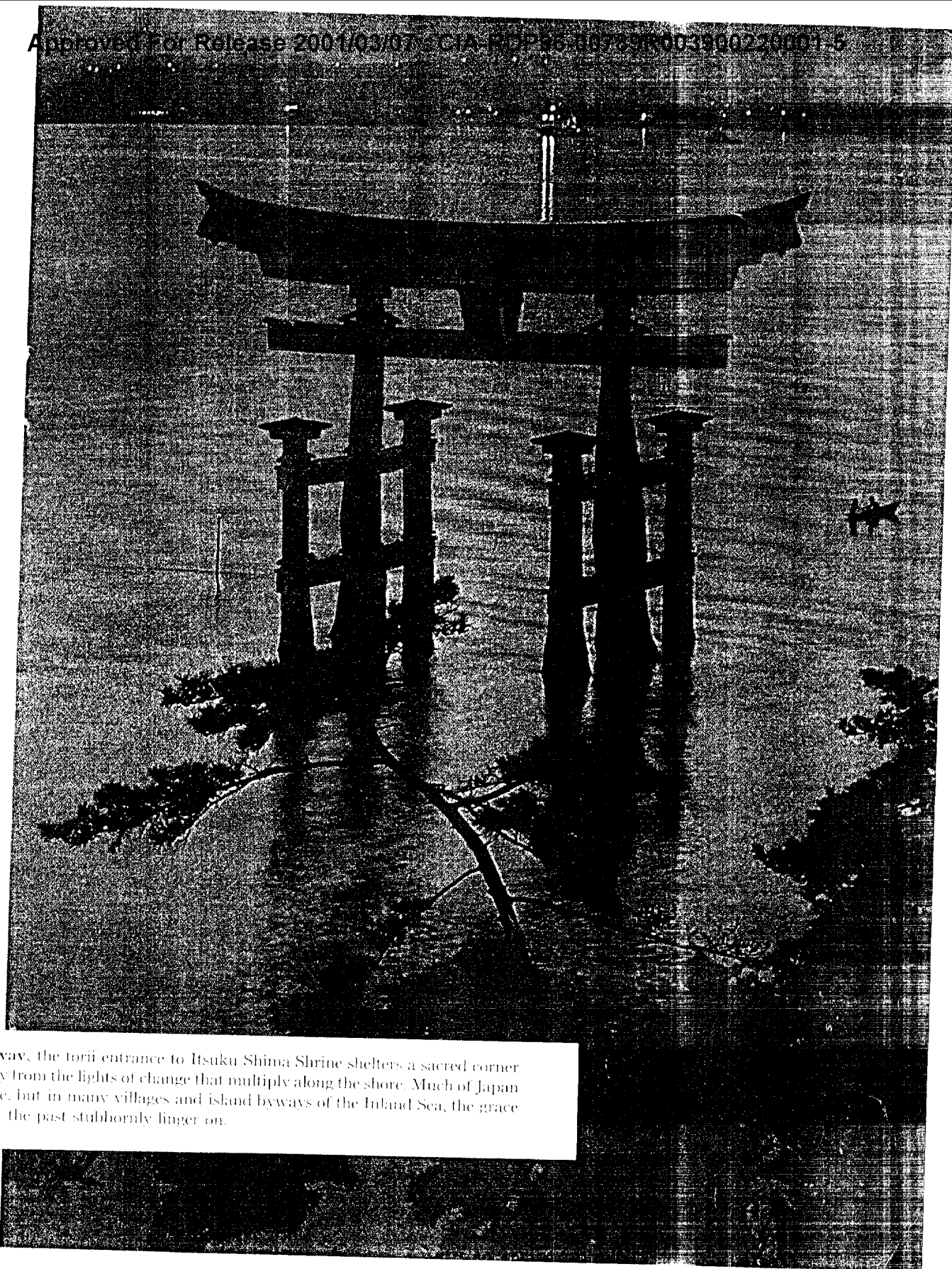
Guardian gateway, the torii entrance to Itsuku Shima Shrine shelters a sacred corner of Hiroshima Bay from the lights of change that multiply along the shore. Much of Japan wears a new face, but in many villages and island byways of the Inland Sea, the grace and traditions of the past stubbornly linger on.