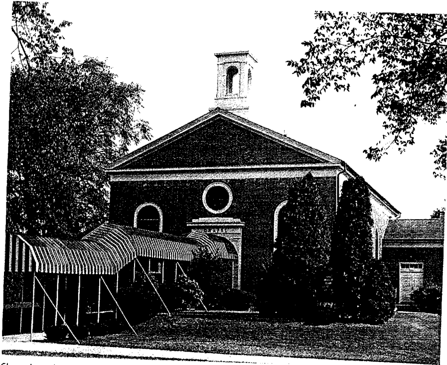
Chapel services are regularly held for the major faith groups – Protestant, Catholic and Jewish.