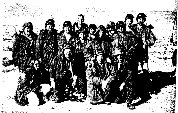
The NRC Committee on a site visit at the Army's National Training Center at Fort Irwin in the Mohave Desert.

Although the overall program has been funded all along by ARI, the concerns it addresses are widely applicable to a broad range of settings and populations in school and both public and private organizations, ranging from nuclear power environments to air traffic control towers.