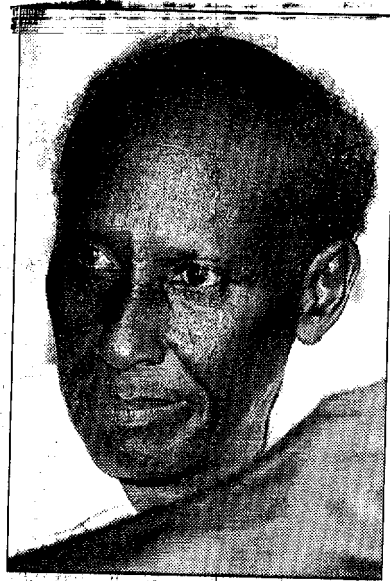
Warlord Mohamed Farrah Aidid travels on foot or in a donkey cart.