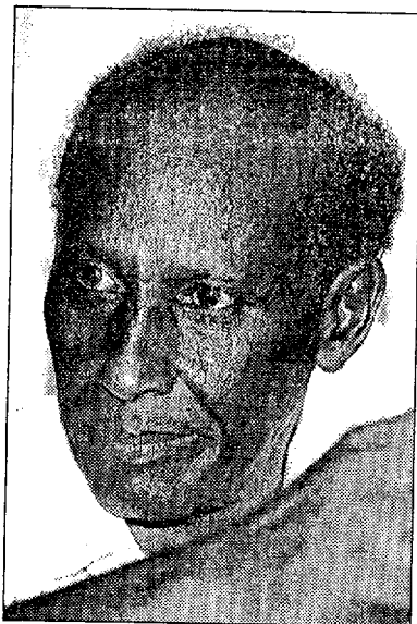
Warlord Mohamed Farrah Aidid travels on foot or in a donkey cart.