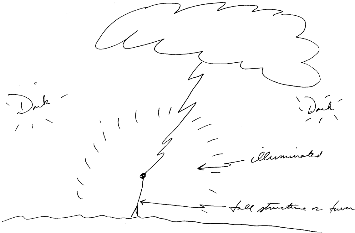
A/S Sketch of lightning striking, a tall object.