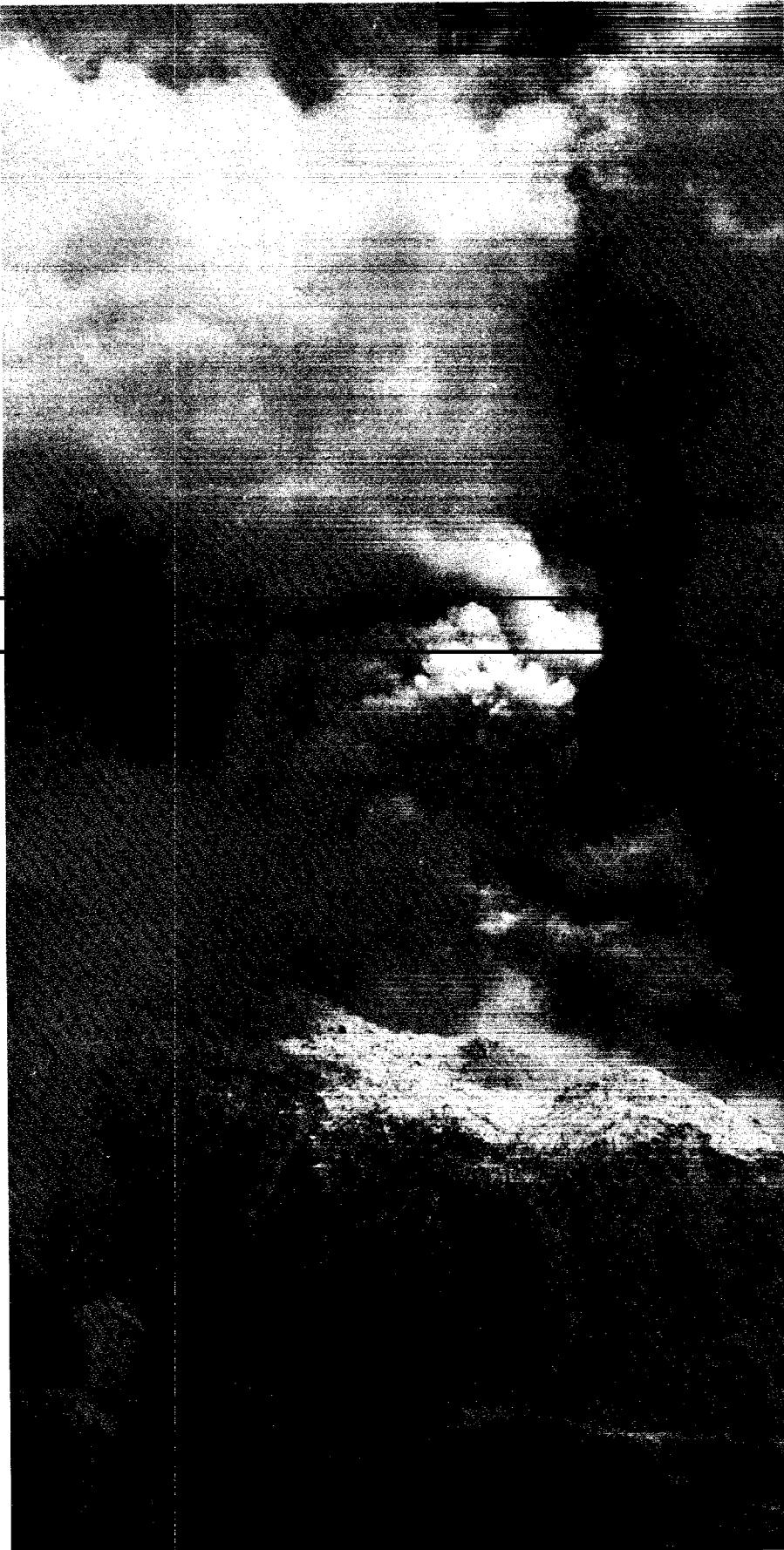
Mount Pinatubo shot plumes of steam and ash 30 km (20 miles) into the sky