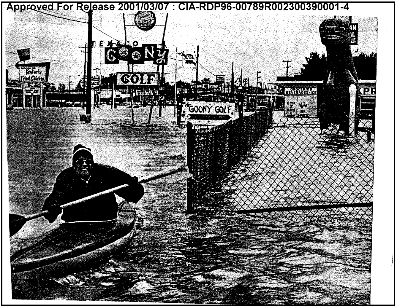
ROBIN HOOD, CHATTANOOGA NEWS-FREE PRESS