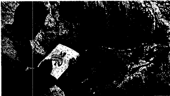
A field worker sketches a fossil that researchers say belongs to the gigantic "Supersaurus" dinosaur.

Researchers from Brigham Young University have unearthed what they say is the largest complex of dinosaur pelvic bones that have ever been discovered.