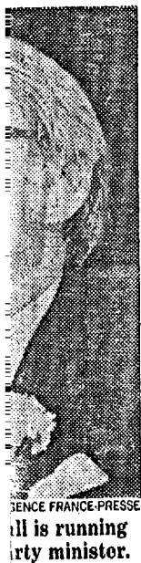
AGENCE FRANCE-PRESSE ... is running ... rty minister.

TAMPA—This is "the next great city," local boosters say as they point to bustling new hotels and office buildings downtown and sleek new planned communities under swaying palms. But boosters can't hide the fact that some central-city neighborhoods—like those in cities across the country—are getting poorer, blacker