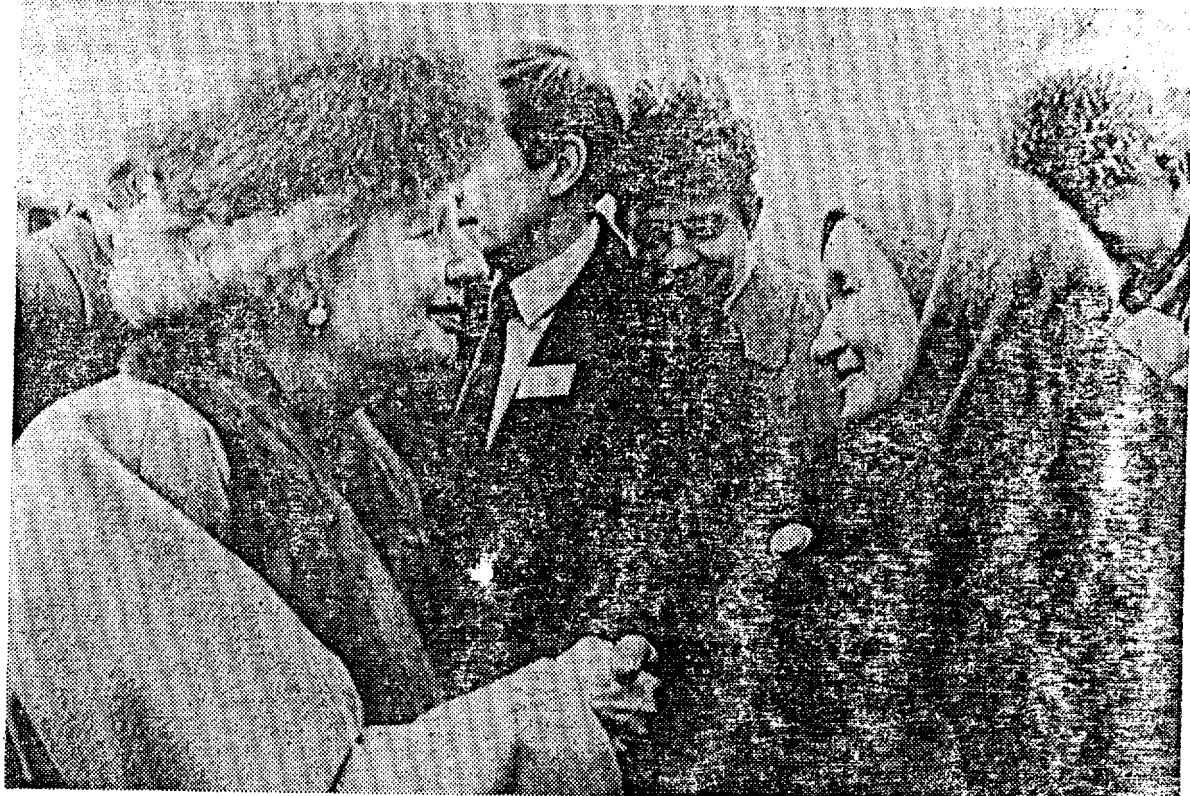
Prime Minister Margaret Thatcher greets woman during a walking tour in Moscow yesterday. Story, Page A13.