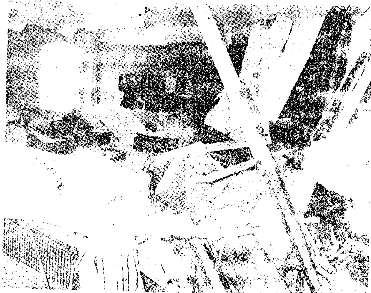
Wreckage inside a room of Libyan leader Muammar Qaddafi's Tripoli headquarters was shown to reporters yesterday.