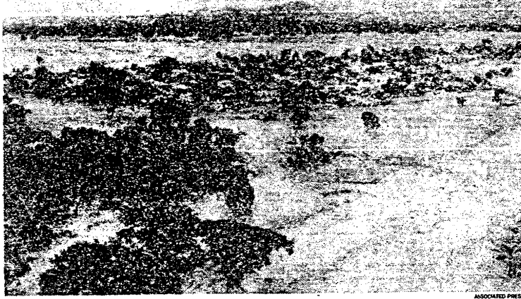
Mud surrounds and partially buries Armero, as seen from a nearby hill. The town center is inundated at lower right.