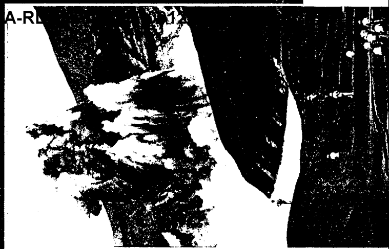
Nearly 3,000 people lived on the five-mile-long by three-mile-wide island before the eruption; many have since returned to their homes. Water-filled crater at center of the large picture formed in a 1911 eruption that claimed 1,335 lives.