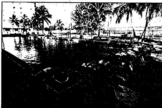
Clockwise from top left: Flutter kicks are a part of nearly every day's training. • Halfway through a set of crossovers, students hang on the wall, gulp in air and prepare to go back under. • During a morning pool session, class members poke their heads under to watch a demonstration.

their mouths would be off, forcing them to hold their breath repeatedly.