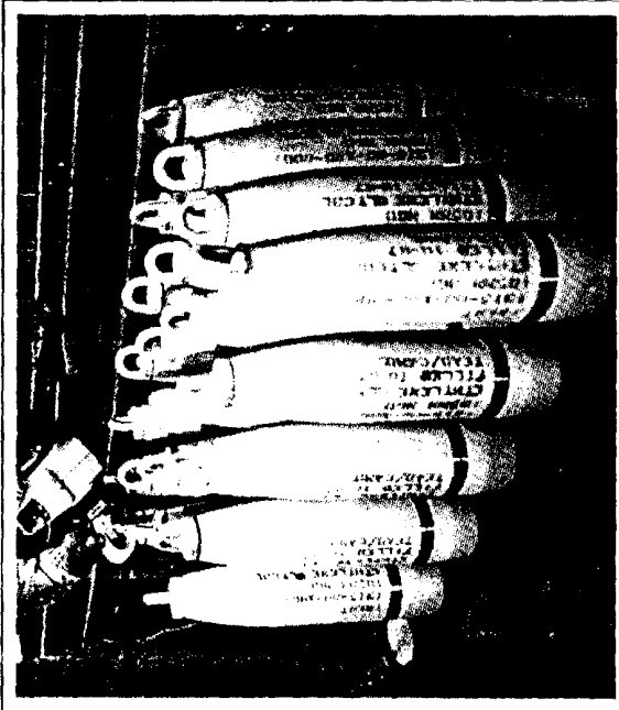
Gas-filled 105-mm shells at a Utah Army depot