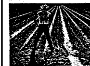
THIS PAGE FOLDS OUT