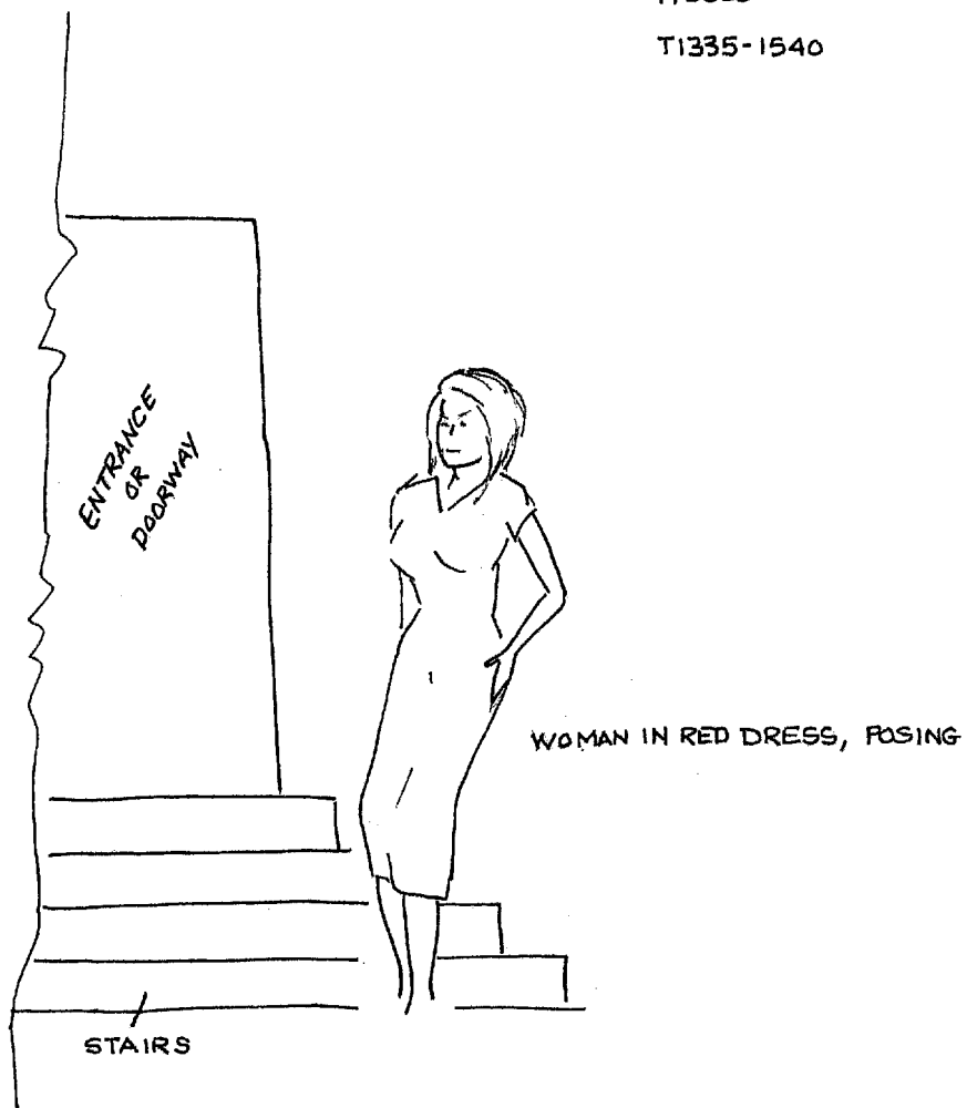
SKETCH # 2