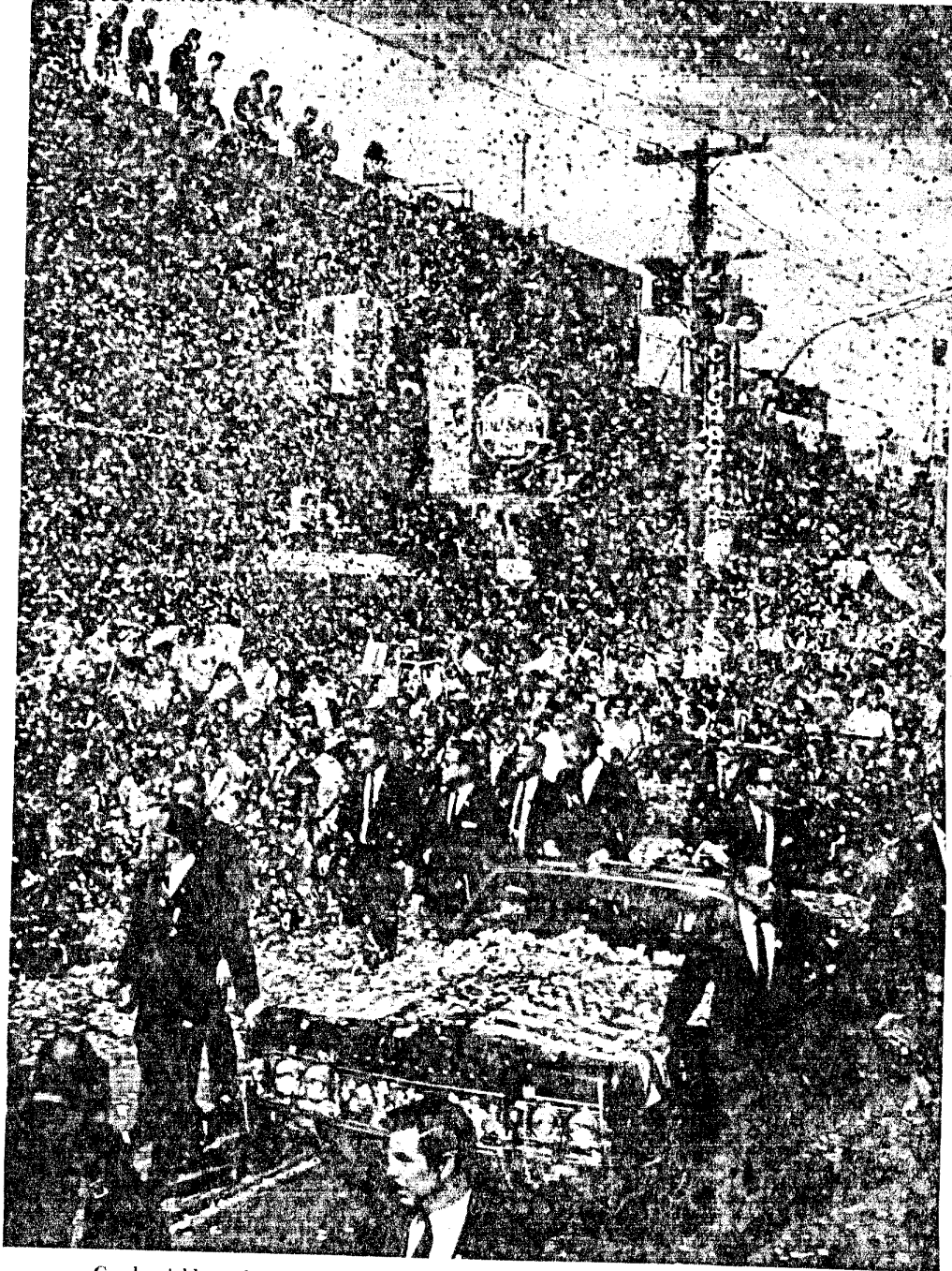
Good neighbors cheer a neighborly swap. Presidents Lyndon B. Johnson and Gustavo Díaz Ordaz ride through the confetti-filled streets of Ciudad Juárez on October 28, 1967. The festivities marked the end of a boundary dispute that arose in 1864, when the Rio Grande flooded and shifted its course. The