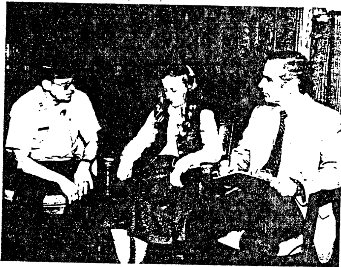
Figure 29-2 Mental Health Professional, Interviewee and Hypnosis Coordinator