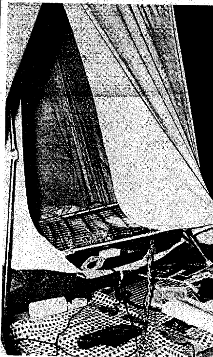
Pup tent in which Dozier was held captive