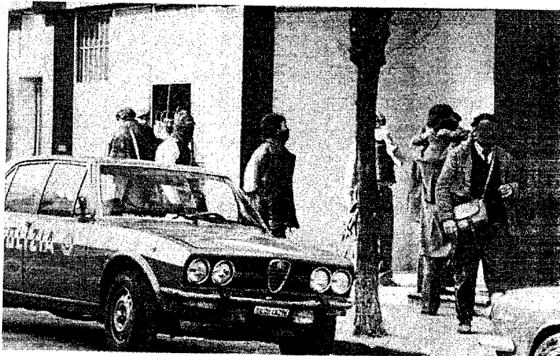
The key address: 2 Via Pindemonte, after the successful raid