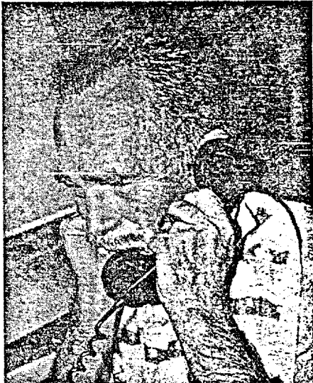
A soldier returns to trim: The last Red Brigades portrait, the first cheeseburger and a shave interrupted by the President