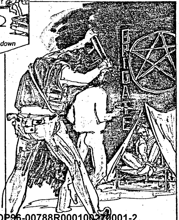
Commando stuns terrorist with a blow to the head before he can shoot Dozier.

Hours after the abduction, the Red Brigades announced that Dozier had been taken to a "people's prison and will be submitted to proletarian justice." Their second communiqué accused Dozier of service as an "assassin and hero of the American massacres in Vietnam." It arrived with a fuzzy snapshot of the captive general revealing a bruise under his left eye apparently suffered during his abduction. Dozier suffered no other physical injuries