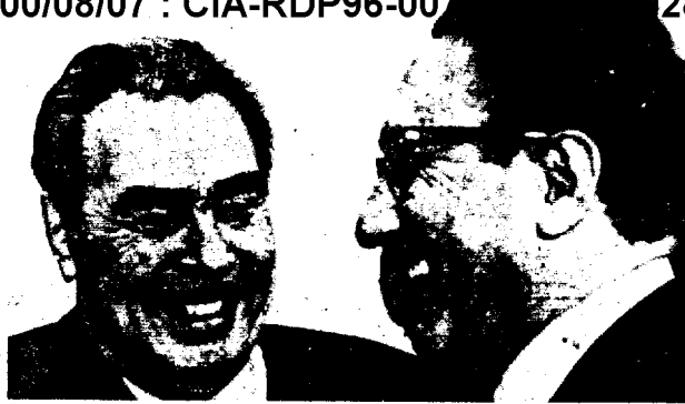
Former US Secretary of State, Henry Kissinger (right), with the Soviet leader, Leonid Brezhnev. The KGB's "Disinformation Section" alleged that Kissinger was a former secret service agent working for Poland, a canard first uncovered and scotched by the Chinese

ive than any other lie-detector techniques and the Israelis are also examining the application of Kirlian photography in intelligence.