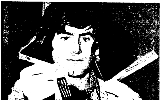
Uri Geller practising spoon-bending and mind bending. The Russians set up a special committee to study him and his experiments

to study him and his experiments three years ago. "We found out that they were doing this in a roundabout way from Paris," said my contact. "At the same time we discovered that they were developing a new form of music to help induce and maintain a state of trance—heliponic music."