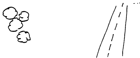
Figure 3. Response with a rating of 1. (Target was a photograph of two long, narrow, distant waterfalls down two steeply vertical, dark, vegetation covered slopes and coming together near the bottom of the photograph to form a "V" shape.)

"I keep wanting to say — specifically — airfield landing strip. Flat land. Big airplanes would land here like naval carriers. Has a broken white line down the center of strip and you see it straight on