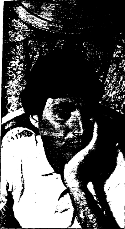
Psychic Geller A secret Fellini or Yves St. Laurent.

touch with the chairman of South Africa's Anglo-Transvaal mining company. The chairman spread out a map and said, "Tell me what you feel." Geller said, "I feel something here," and years later, Geller says, the company found coal on the spot. "That's when I learned I could do this for very big companies and profit myself also. For seven years I have been doing this, and nobody knows anything about it."