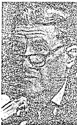
VERNON A. WALTERS ... appointed in 1972

Walters also said that Nixon's counsel, John W. Dean III, at one point suggested to him that CIA covert funds could be used to pay the bail and salaries for the five Watergate burglars. Walters refused.