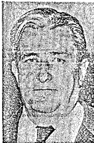
Vernon A. Walters

"He has been a distinguished Army officer for the past 35 years.