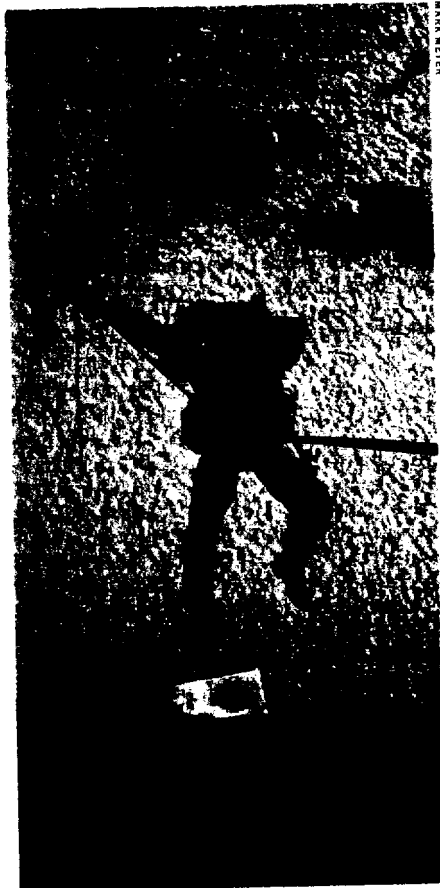
Navy strike team trains in California

We also need improved cooperation among free-world intelligence services. As long as we have a leaky Congress and a leaky oversight process, friendly services