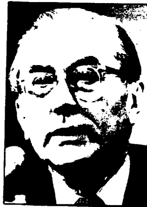
AP Wire World

"Sure," Colby says. "it's a shock to be fired, but it's the end of a job, not the end of your life." [E]