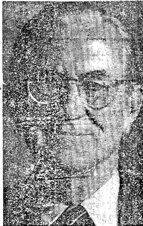
WILLIAM E. COLBY