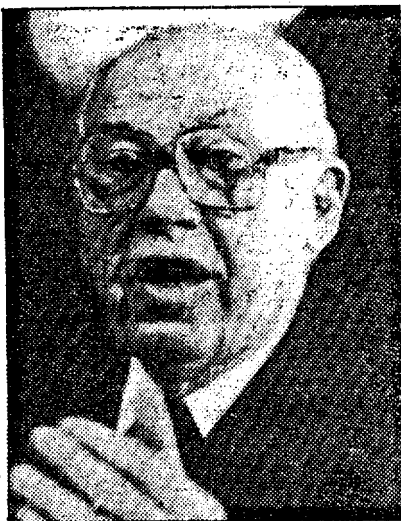
William Casey

Maybe it was significant. Just before noon Saturday the motorist saw the obvious police or Secret Service vehicle followed by a limousine in the Foxhall Road area. Pulling alongside at an intersection, the motorist peered into the back of the car to see if he could recognize the passenger. It was CIA Director William J. Casey deeply into The New York Times' stock market listings.