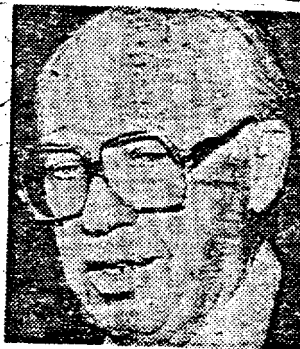
WILLIAM CASEY First-hand look.

Publicly the Administration will admit only that the operation against Nicaragua is to interdict supplies to left-