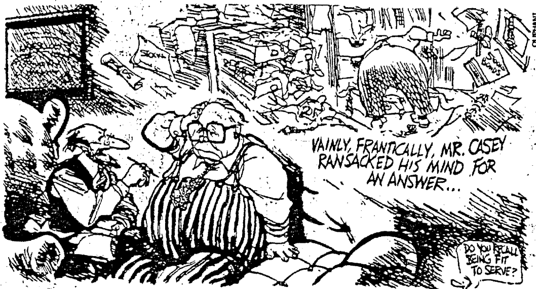
'Now think—does the name 'Casey' mean anything? Does 'CIA' mean anything? Does 'El Salvador'? 'Nicaragua'? 'Carter Briefing Book'? You Recall Nothing?'